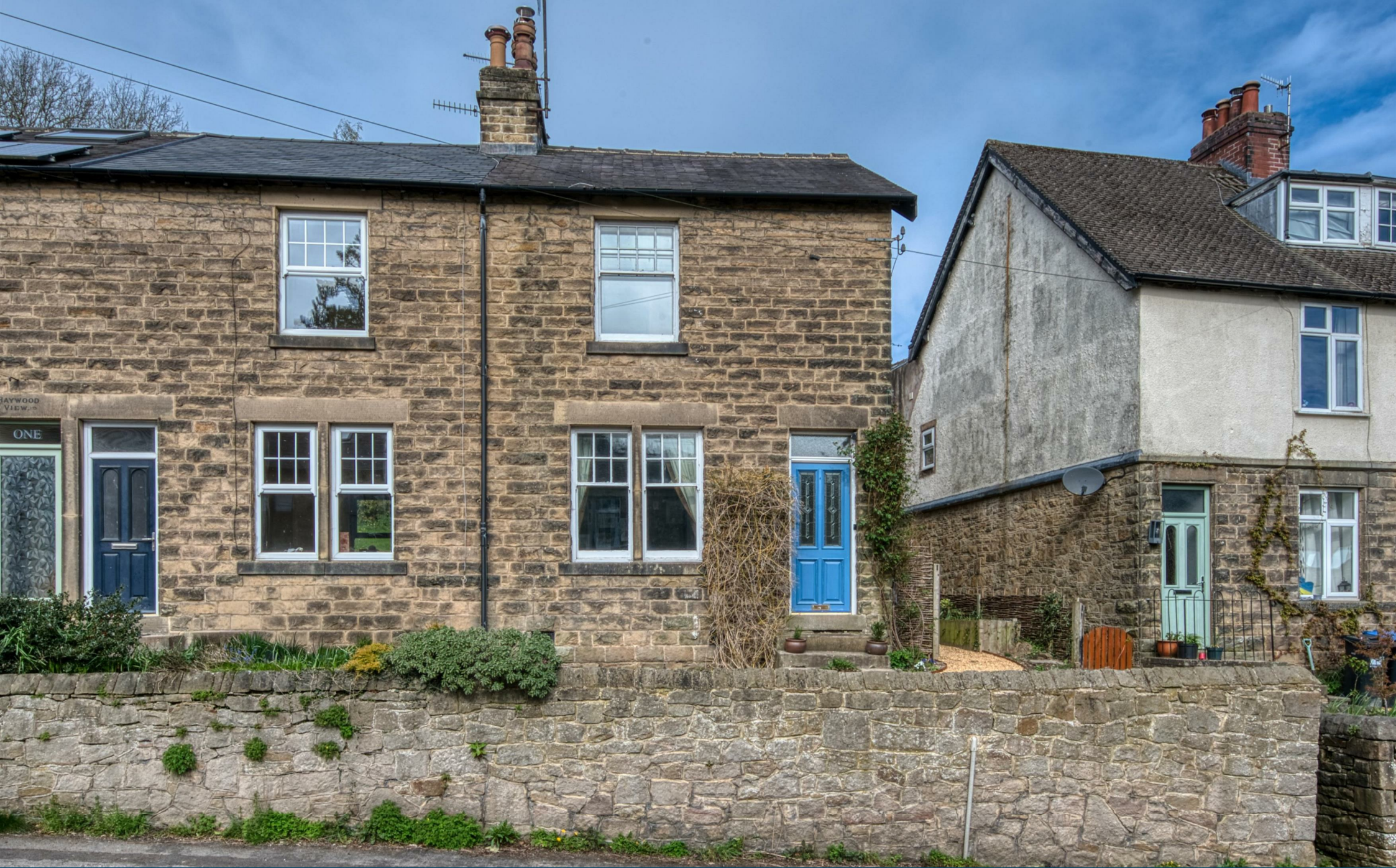
3 Haywood View, Grindleford, Hope Valley, Derbyshire, S32 2HJ